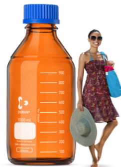
UV-PROTECTED DURAN® AMBER

Retaining the best features of the original bottle, this next-generation of laboratory bottles offers improved ergonomic features, user safety, and a dedicated system of useful components.