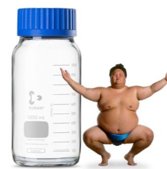
EXTENDED DURAN® GLS 80®

A stronger-built bottle that offers a safer option for laboratory applications involving vacuum or moderate pressure. Safely extends the range of possible applications for glass laboratory bottles.