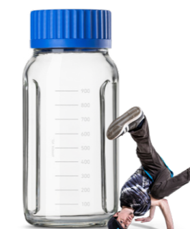
SWIRLED DURAN® BAFFLED

All the features of the ORIGINAL GL 45 DURAN® bottles, with the added benefits of a larger mouth. Hassle-free filling, emptying, and cleaning, are just some of the benefits of having easier access.