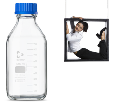
SPACE-SAVING DURAN® SQUARE

Combining the best of both worlds, the virtually inert glass protects the contents from contamination, while the external plastic safety coating protects both the user and contents from accidents.