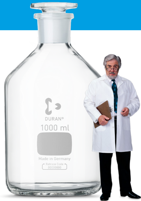
TRADITIONAL DURAN® REAGENT BOTTLE