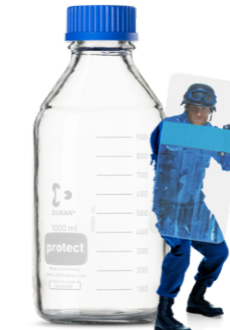
PROTECTIVE DURAN® PROTECT

The optimized conical design allows the most efficient delivery of mobile phase to HPLC analyzers. Graduated for easier volume determination. The virtually inert glass prevents leaching of extractables.