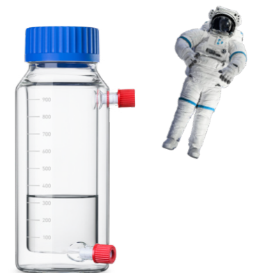
ISOLATED DURAN® DOUBLE WALLED

The ultimate bottle for high-efficiency mixing combined with the benefits of the wider GLS 80® mouth. The built-in glass baffles improve top-to-bottom circulation and radial mixing.