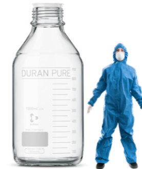
PURE DURAN® PURE

The smart, reusable bottle for cell culture media preparation. The unique design offers two positions: upright for filter sterilization or storage, and tilted at 45° for pipetting in biosafety cabinets.