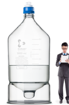
EFFICIENT DURAN® HPLC

A range of high-quality bottles and closures developed for the needs of the pharmaceutical industry. The bottles meet the requirements of the international pharmacopeias and are available with the certificates required by the regulatory authorities.