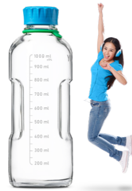
SMART DURAN® YOUTILITY®

The gold standard of multi-functional laboratory bottles made of a high-purity borosilicate glass 3.3. A combination of high-performance materials and robust design provides a long usable working life.