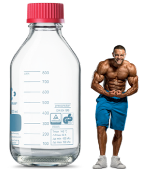
STRONGER DURAN® PRESSURE PLUS+

Close and efficient packing is the benefit of the space saving shape. Ideal for the shipping and storage of high-demand materials. For reagent supply to instruments where bench space is at a premium.