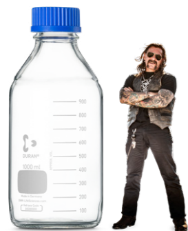
ORIGINAL DURAN® ORIGINAL GL 45

The bottles come with a comprehensive range of caps, connection systems and accessories that allow you to put together your own individual system for high-precision applications.